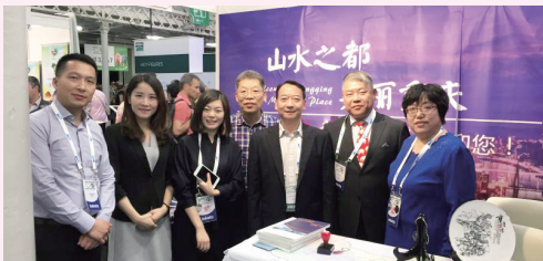
IPVS2018 promotion in Dublin, 2016