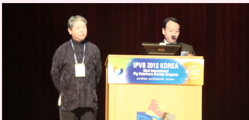
Statement for the second bidding, Jeju 2012