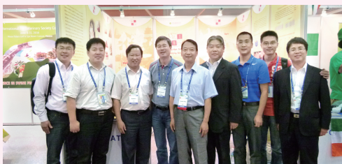
The second bidding in Jeju, 2012