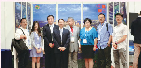
The third bidding in Cancun, 2014