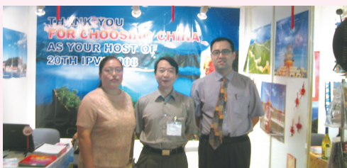
China bidding team in Hamburg, 2004