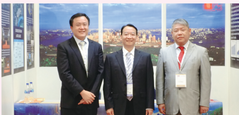
The bidding team in Cancun, 2014