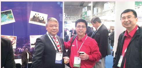
Chinese delegates in Dublin, 2016