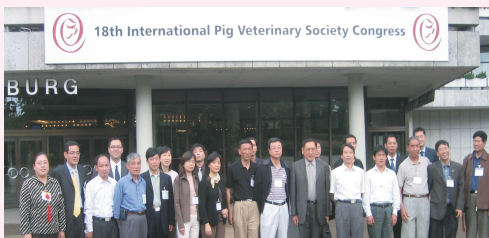
The first bidding in Hamburg, 2004